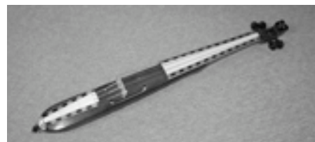
▲ Pamela’s photo of Simon’s pochette

Cavatina’s work now includes chamber music competitions and master classes at Trinity College of Music; free ticket schemes at 27 venues for youngsters aged 8 to 25; and student ‘ambassadors of chamber music’ in colleges and universities. The tireless Majaros also have plans to sponsor quartet master