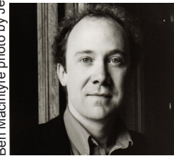
'Operation Mincemeat: the true spy story that changed the course of World War II' by Ben Macintyre, Bloomsbury, January 2010